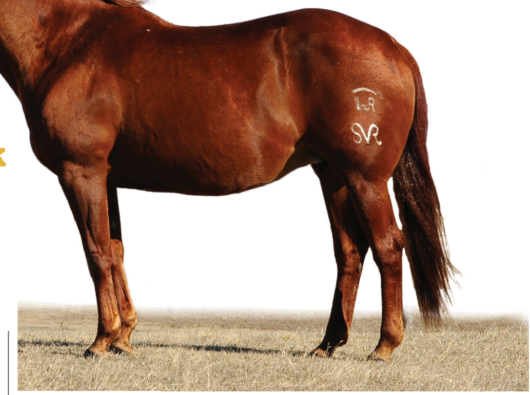
The Smart Look, pictured in 2009, is living a life of leisure at Wrigley Ranches.

"It was apparent to me that I would not be able to own another living legend like her