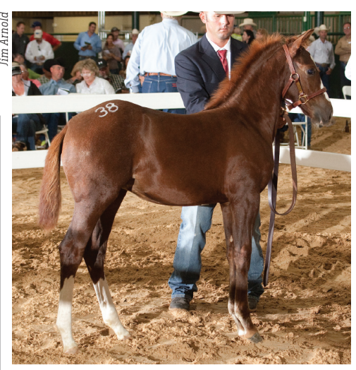
SVR Look Cat Me sold as a weanling in a package deal with her dam. The Smart Look.