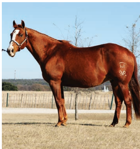
WR This Cats Smart's dam, The Smart Look

The appearance of Royal King in the scheme of things is an indication of what is called a blood affinity between the stallion and mare. These blood affinities are common in nicks. This time, it is the sire side and Smart Little Lena. His dam is Smart Peppy, who is out of