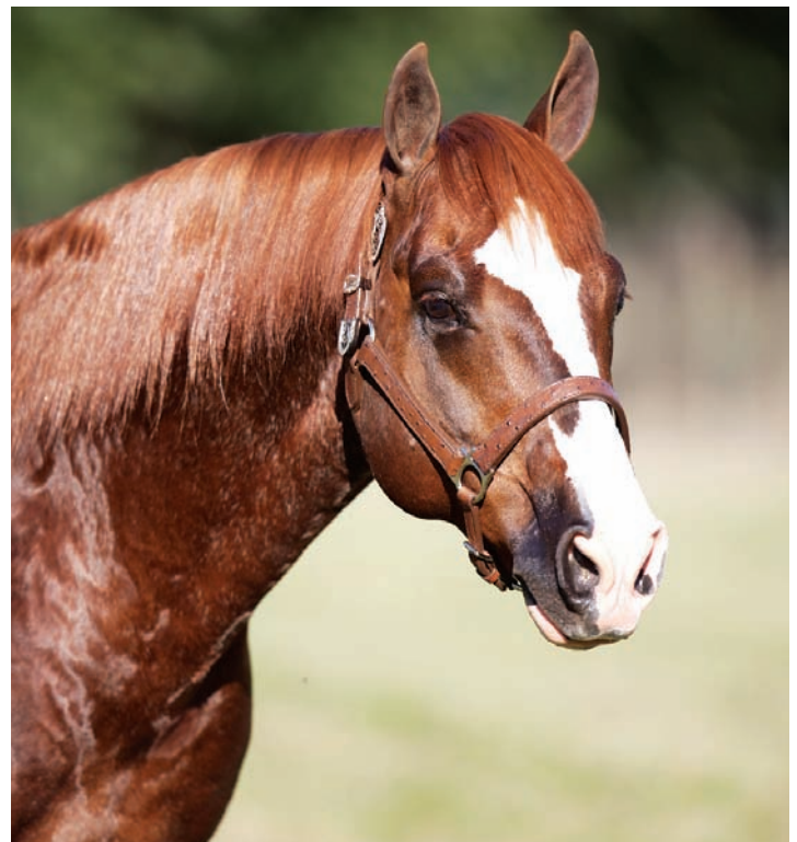
Equi-Stat Leading Junior Reined Cow Horse Stallion WR This Cats Smart