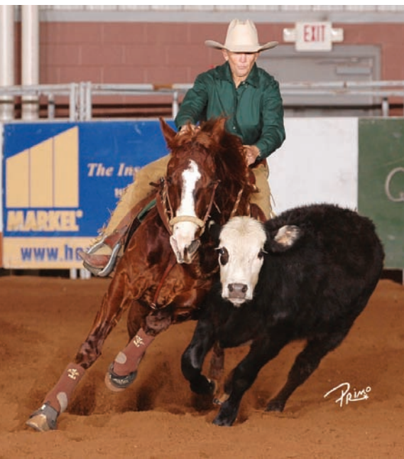
Tuckers Smart Cat is WR Smart Cat's leading reined cow horse money-earner.