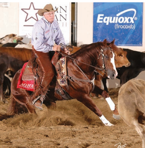
Sinful Cat is WR This Cats Smart's second-leading reined cow horse money-earner.

The next situation seen in these pedigrees is what is called the return of the