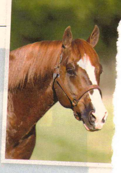
WR This Cats Smart

Overall, 101 performance horses sired by WR This Cats Smart (High Brow Cat x The Smart Look x Smart Little Lena), mainly cutters but also a few working cow horses, one reiner and one barrel racer, had earned more than $1.3 million heading into July. He stands at The Four Sixes Ranch, Guthrie, Texas. —MT